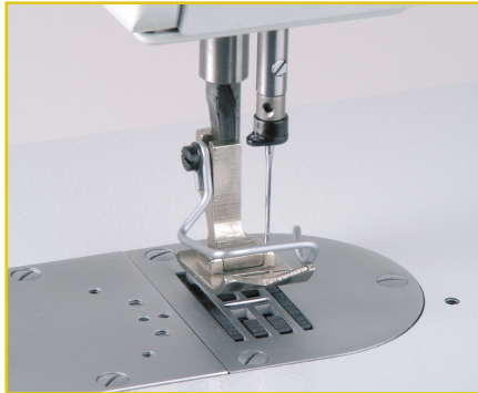
4-Row feed-dog for positive fabric control

The Global ZZ 1567 is a single needle high speed flatbed zig-zag machine with a variety of cams. This industrial machine is designed for decorative zig-zag stitching. The ZZ 1567 AUT is equipped with thread trimmer, back tack and presser foot lifter (electric).